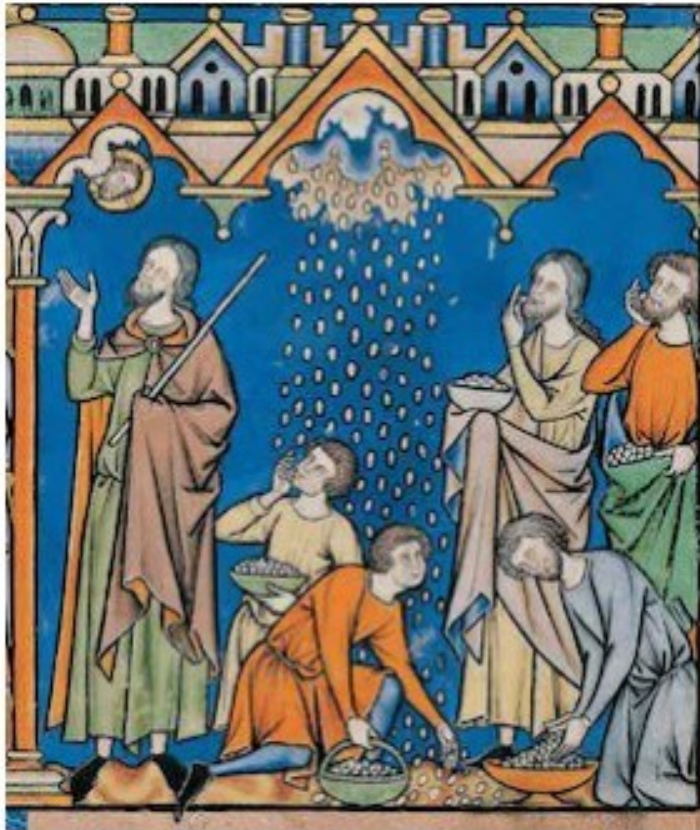
Manna from Heaven, Illustration in The Crusader Bible, France, Paris, 1240